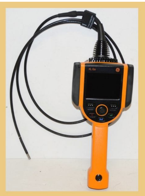
DIAGNOSING LEAKAGE The root cause of the problem