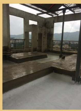
SURFACE TREATMENT LIQUID MEMBRANE